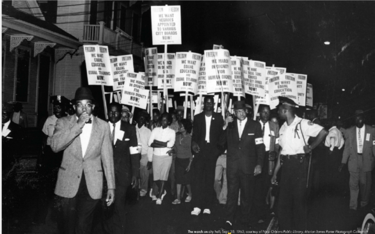
The march on city hall, Sept. 30, 1963, courtesy of New Orleans Public Library, Marion James Porter Photograph Collection

5. What is this photo showing: a sit-in or a protest march?