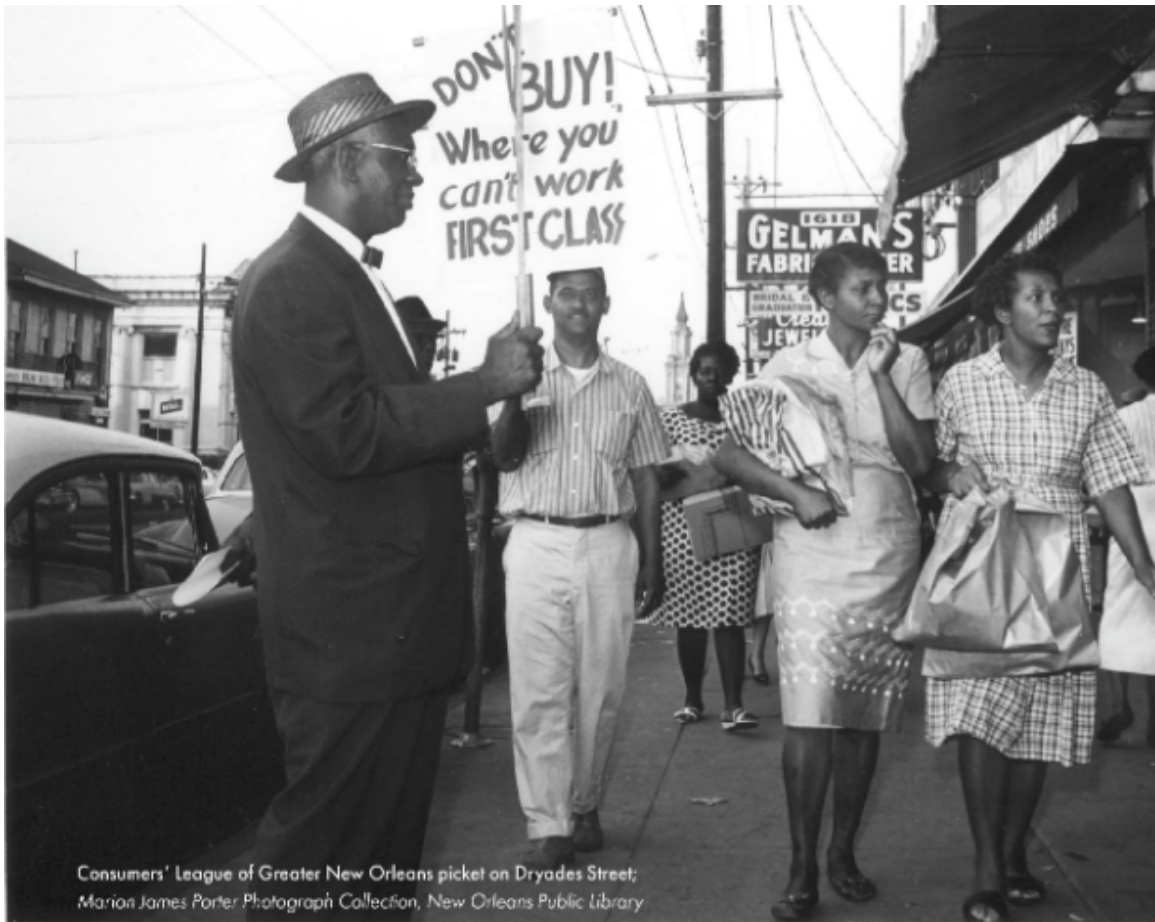
Consumers' League of Greater New Orleans picket on Dryades Street

2. Were African Americans treated as second-class or first-class citizens by white-owned businesses?